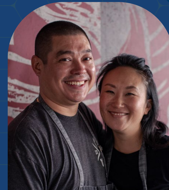
Toki Sawada Binchoyaki Japanese Cuisine